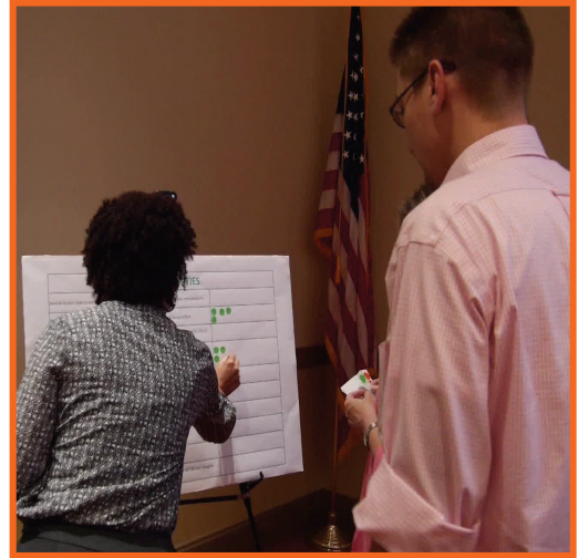
Public Meeting.

We are here! The next steps are to identify potential strategies and alternatives and then to screen and evaluate them. Also, stakeholder and technical committee meetings early this fall to discuss the alternatives analysis!