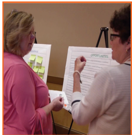
Public Meeting.